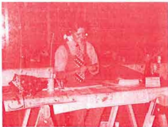
Wow! Those gals must have robbed a bank!