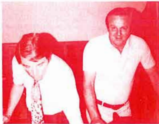
Talk about high rollers...