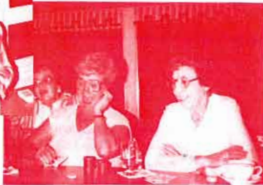
"Did I do that?"