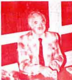
Las Vegas Hit Man.

One gal I know is still feeling a bit lighter, $23 lighter in fact. But says it was worth it.